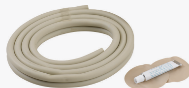
Hose & repair kit